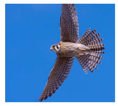
An American kestral, a migratory species that ranges from Alaska to South America.

Figure 1 . Visual representation of how each stage of the mitigation hierarchy can reduce potential biodiversity impacts from proposed developments. Offsets, restoration, and compensatory mitigation can lead to net gains in biodiversity. Image adapted from Rio Tinto and Biodiversity (2008) <sup>I</sup>