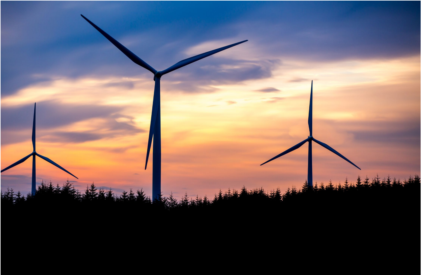
Wind turbines near Rogaland, Norway.