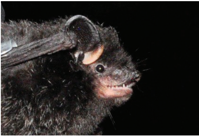
Silver-haired bat.

It is critical to understand which stimuli are driving attraction and at what distance the stimuli are detected by bats. To enhance existing, or develop new minimization solutions, we must understand how bats perceive their environment, particularly the visual characteristics of wind turbines. Here, we briefly describe what we know about bat visual systems, how wind turbine visual stimuli may interact with bat visual systems, and what next steps we might take to fill knowledge gaps and identify effective mortality minimization solutions.