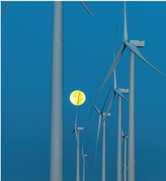
Wind turbines in moonlight.

The reflection of moonlight or starlight off wind turbine surfaces may create visual cues that bats interpret as open flyways, leading them into dangerous proximity to moving blades. Jonasson et al. (2025) found that bats flying through a Y-maze were at least twice as likely to fly toward white wind turbine blade sections compared to less reflective black ones. This attraction intensified when one of the Y-maze exits was a dark, empty flyway, with 74% of hoary bats and 97% of silver-haired bats flying toward the white wind turbine blade. These findings suggest that hoary bats and silver-haired bats, two species that make up 44.9% of fatalities at wind energy facilities (Allison and Butryn 2020), may be attracted to wind turbine surfaces when they reflect ambient moonlight and that mortality minimization measures that reduce the reflectivity and contrast of wind turbines could be a valuable avenue for mortality minimization solutions.