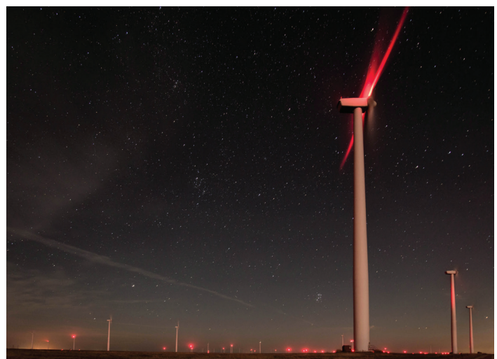
Aviation lights on wind turbines.