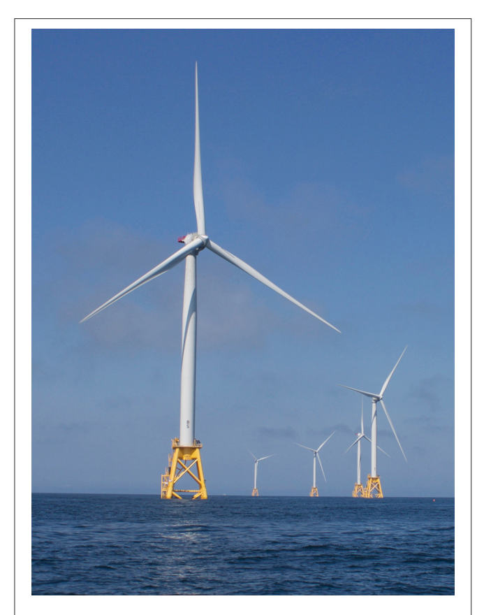
FIGURE 2 | Block Island Wind Farm (photo by A. Calianos).

It is worth commenting on the relatively small sample size of commercial fishers in this study. As noted earlier, limited commercial fishing took place within the BIWF area prior to wind farm construction. We attempted to recruit as many commercial fishers as possible who had fished in and around the BIWF. According to the interview respondents, the fishers participating in this study comprised much of the active commercial fishing going on in the BIWF area.