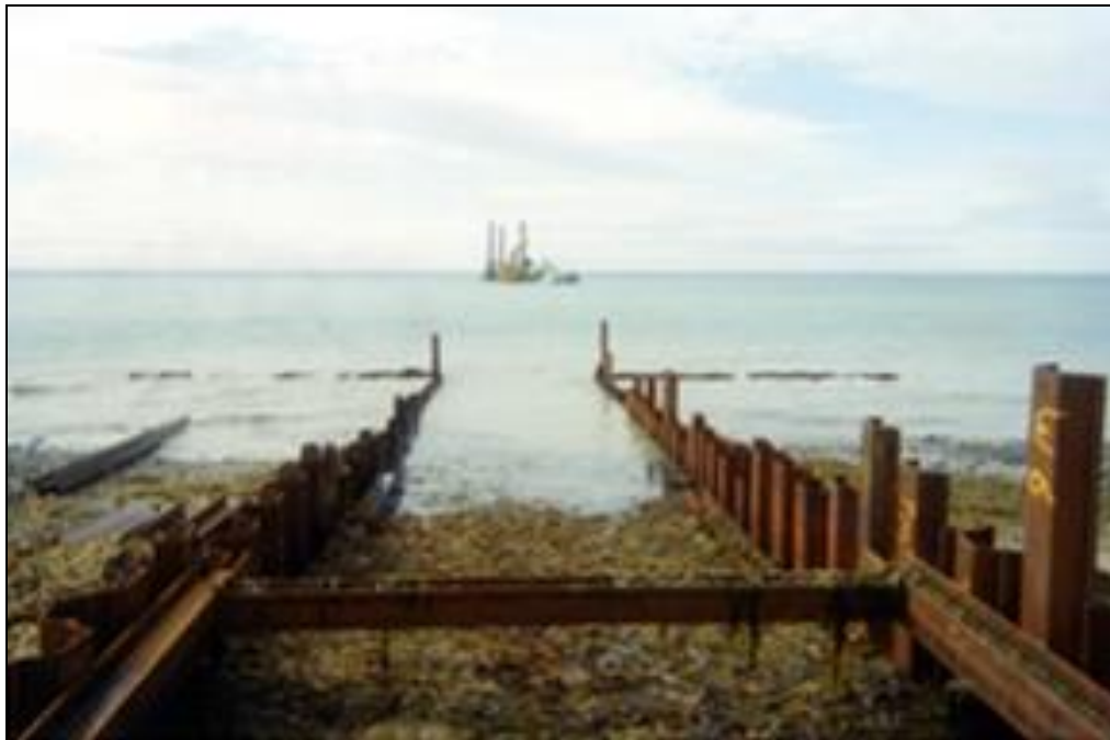
Figure 3: Example of a sheet piled cofferdam often used for cable pull operations at landfalls

The depth of excavation is dependent on site morphology and coastal processes, and that the open trench will be able to remain stable and 'open' long enough to achieve the cable installation before burial. If site conditions do not allow this then temporary trench support is required, usually in the form of steel sheet piling for cofferdam construction (see Figure 3). These are often require a burial depth of up to 3.0m below lowest expected beach level, to take into account long-term variations in beach profiles and in consideration of the security of the cable.