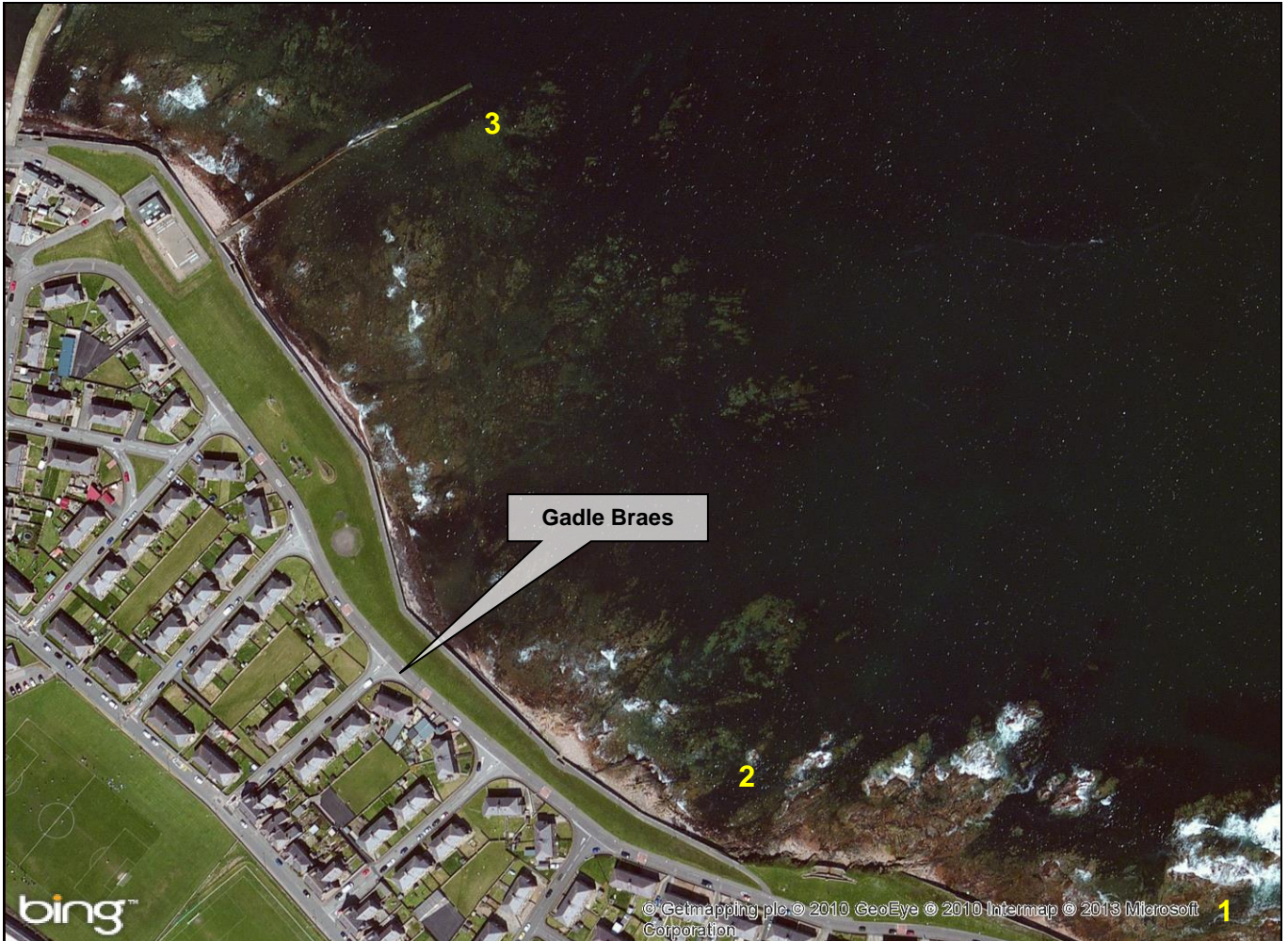
Figure 6: Landfall Site 2 - numbers refer to photos

An aerial photograph of Site 2 is shown in Figure 6 below. Note this site is the base case cable landing location.