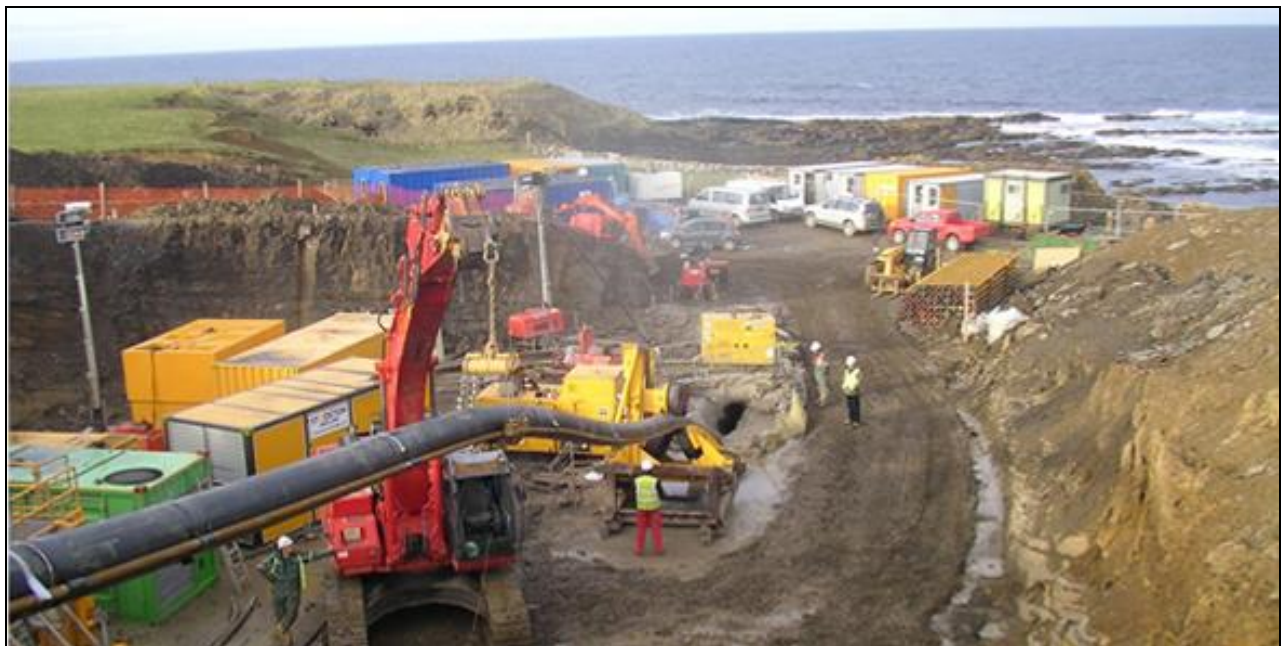
Figure 9: Long HDD drilling for a landfall (Stocktan Drilling Ltd).

As with all methods of land construction and excavation (e.g. building access roads, levelling ground, clearing areas for temporary support facilities, such as water tanks, etc.), there is still damage to the environment that needs to be carefully managed through proper planning and risk analysis to keep it to a minimum. This includes managing water used for the boring and what comes out of the borehole if close to sea level. Generally, this usually causes minimal disturbance, but in environmentally sensitive areas, the vegetation and wildlife need to be protected.