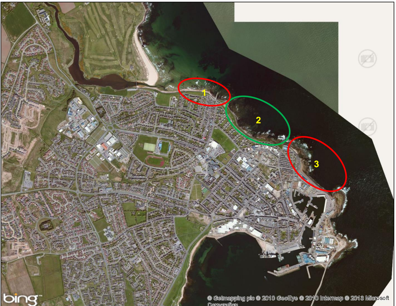
Figure 1: Proposed cable landfall locations – 1, 2, and 3. Base Case landfall is Site 2.

The scope of this document is to present the findings from a brief engineering geological site walkover of each proposed landfall location to understand the geomorphological and technical constraints each site offers. The walkover was performed on 16 th July 2013 between 11:00 – 13:00 during low tide.