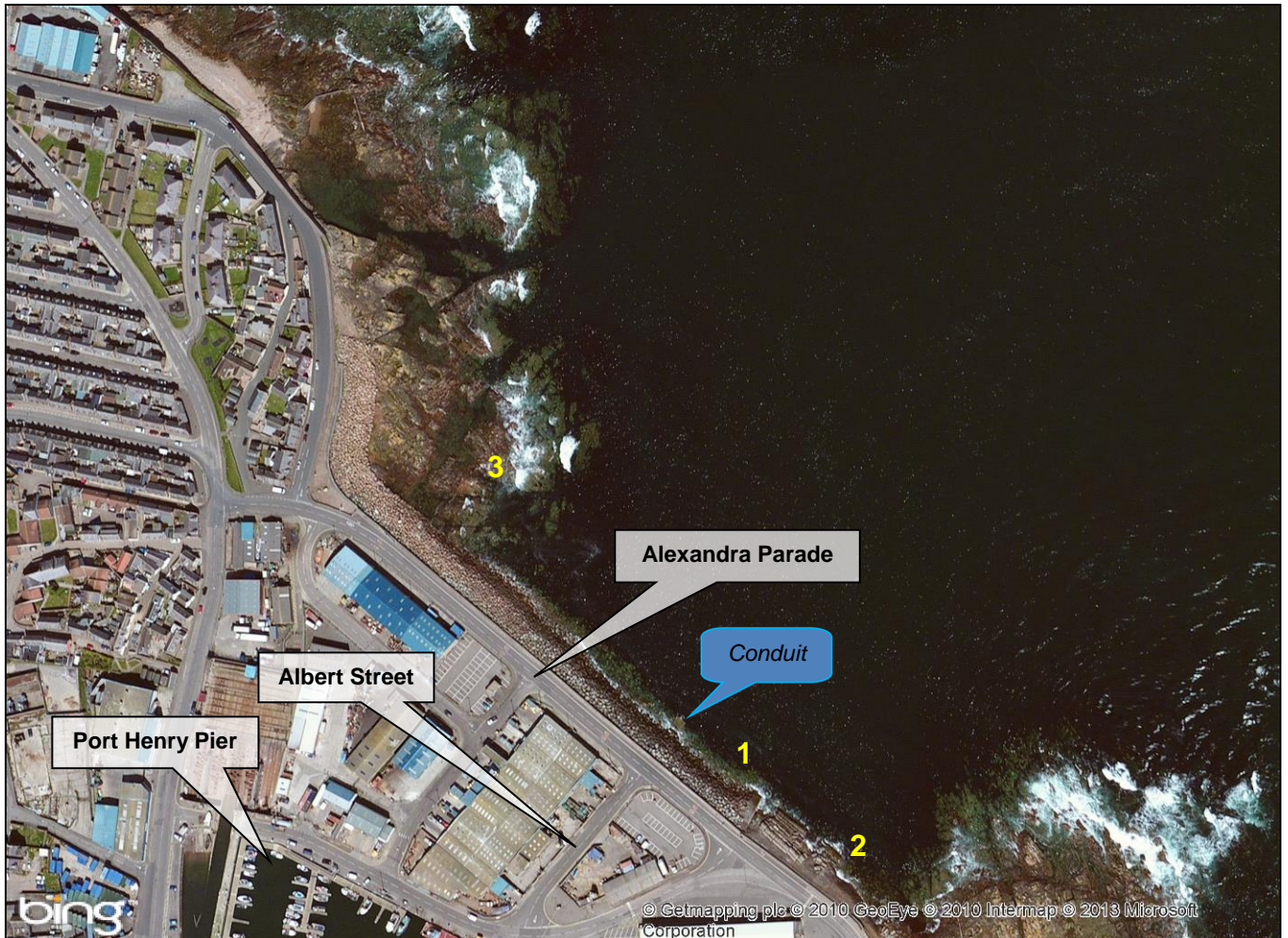
Figure 7: Landfall Site 3 - numbers refer to photos

An aerial photograph of Site 3 is shown in below. Note this site may not be considered feasible due to consenting issues.