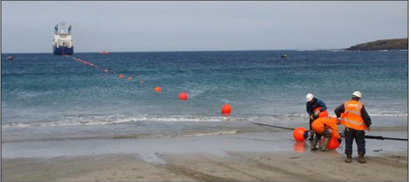
Figure 4: Example of a cable lay vessel linked to a shore approach at a beach landfall

Once a trench has been formed, the offshore cable can be installed from the cable lay vessel by a combination of floating and pulling the cable ashore using a pulling head from a land-based winch (see Figure 4). Therefore, additional consideration to the approach from offshore also needs to be looked at for landfall site suitability.