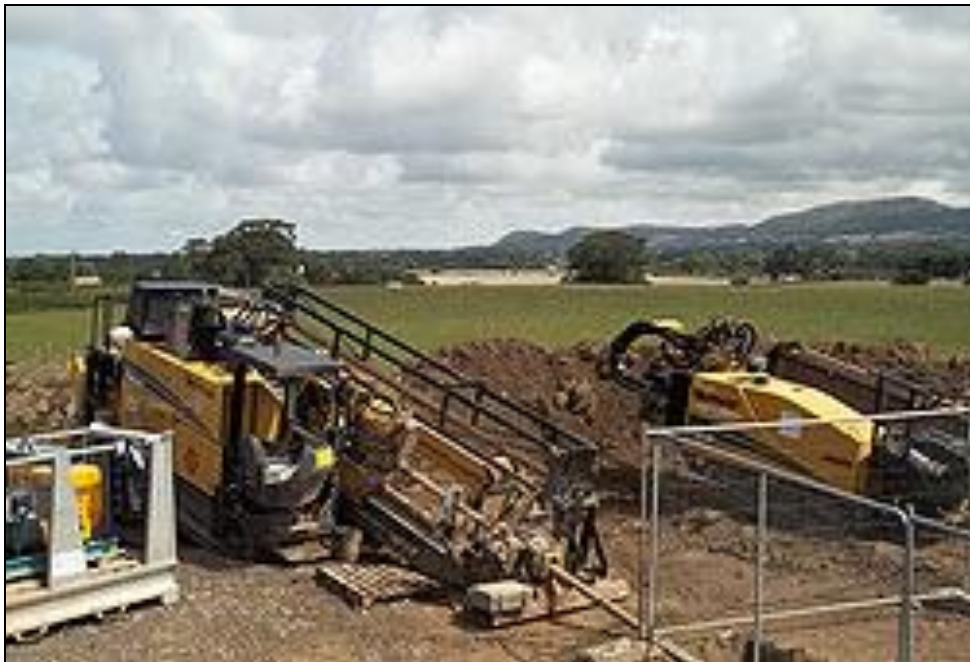
Figure 8: Typical short/long HDD drilling tools (Land and Marine Ltd).