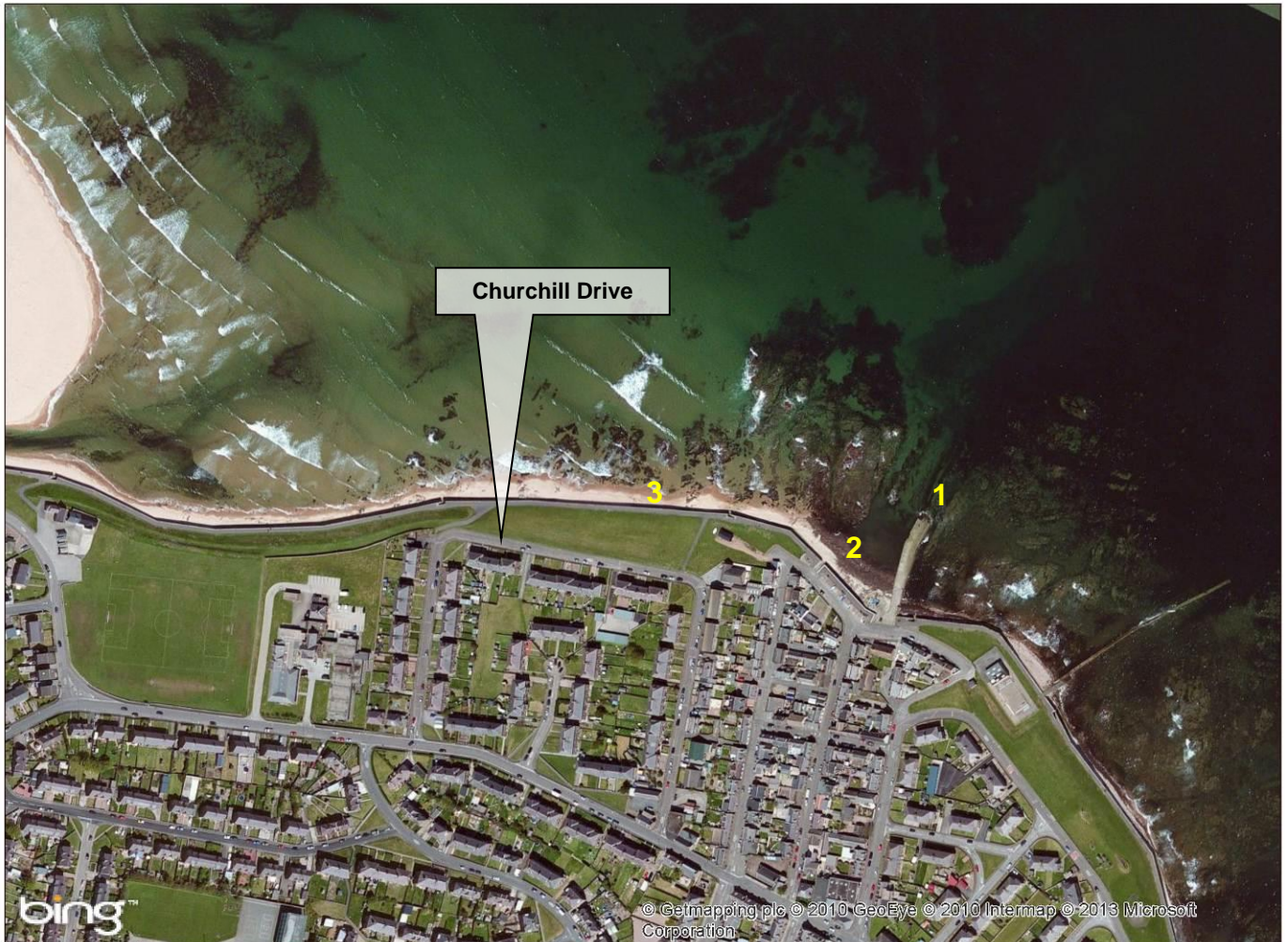
Figure 5: Landfall Site 1 – numbers refer to photos

An aerial photograph of Site 1 is shown in Figure 5 below. Note this site may not be considered feasible due to local fisherman concerns and local recreational amenities being close to the foreshore.