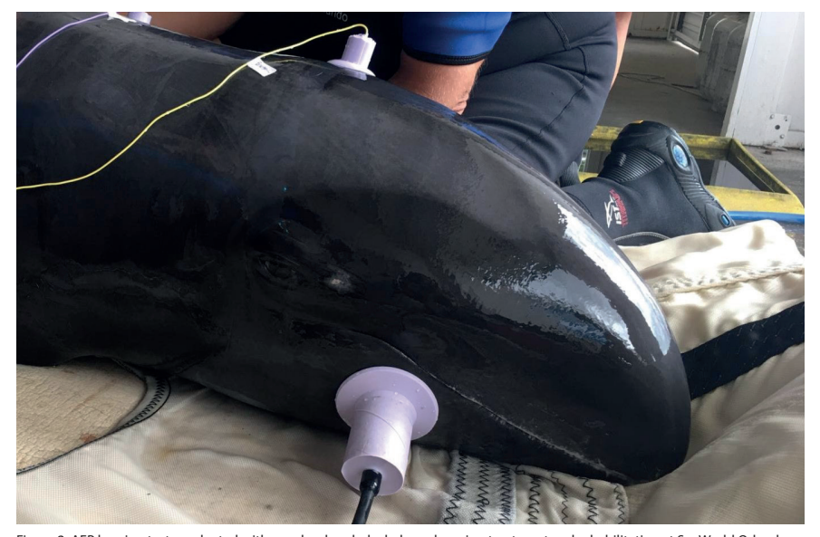
Figure 2. AEP hearing test conducted with a melon-headed whale undergoing treatment and rehabilitation at SeaWorld Orlando. This image is reproduced under permission of National Marine Fisheries Service permit #21026.

The performance of AEP hearing tests is now almost routine with stranded and rehabilitating toothed whales within some regions of the United States [2]. Indeed, strandings are the primary means by which novel species of toothed whales become available for audiometric testing (Figure 1). In the last four years alone, testing opportunities with stranded or rehabilitating toothed whales have allowed four novel species to be tested, including