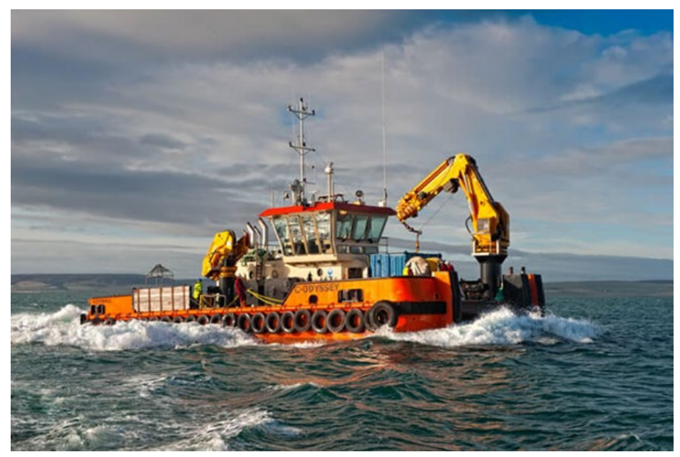
Figure A2 Representative vessel utilised for Shetland Tidal Array operations.