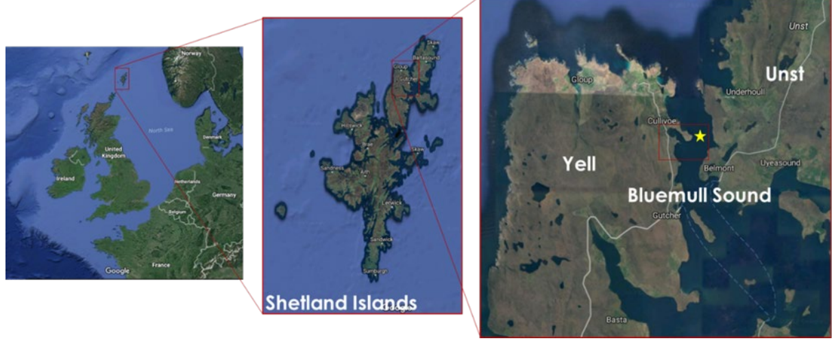
Figure A1 Location of the Shetland Tidal Array (indicated by yellow star).

Bluemull Sound is an active channel for shipping and the Shetland Tidal Array site is located less than 1km from a busy, multiuse harbour at Cullivoe, comprising a pier and small boat marina. In 2017, Cullivoe was the 12<sup>th</sup> largest whitefish landing port in the UK <sup>20</sup>. It is also used as a base by a number of aquaculture operators (mussels and salmon). The small marina currently provides berthing facilities for 14 boats, with plans to expand these facilities along with those at Cullivoe Pier.