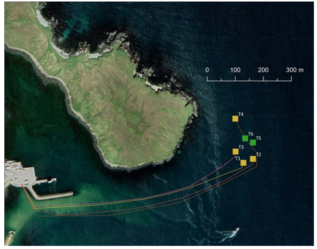
Figure 2-2: Shetland Tidal Array installed layout, including six turbines and five export cables.