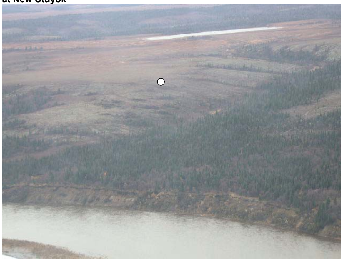
Figure 6 shows the approximate location of the "future met tower" ridgeline at New Stuyok