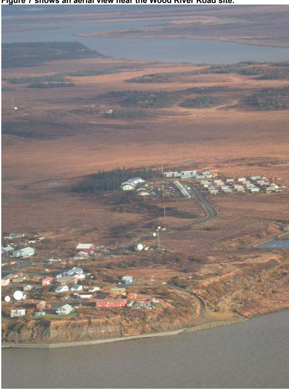
Figure 7 shows an aerial view near the Wood River Road site.