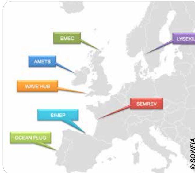
European wave energy test centres associated with the SOWFIA project