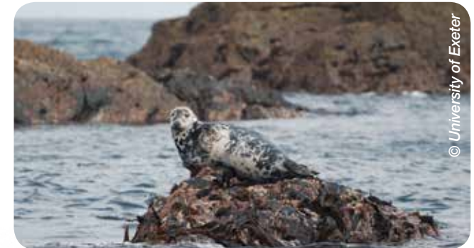
Seal on a rock, north coast Cornwall