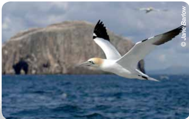
Gannet, Bass Rock, Scotland