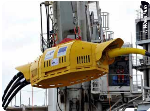
Deployment of Wave Hub infrastructure, Cornwall

The European-funded SOWFIA project aims to facilitate the development of European wide coordinated, unified and streamlined environmental and socio-economic Impact Assessment (IA) tools for offshore wave energy conversion deployments.