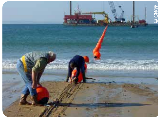
Submarine cable installation

More details and specific monitoring recommendations can be found in the final report from Work Package 3 which can be downloaded from the SOWFIA website.