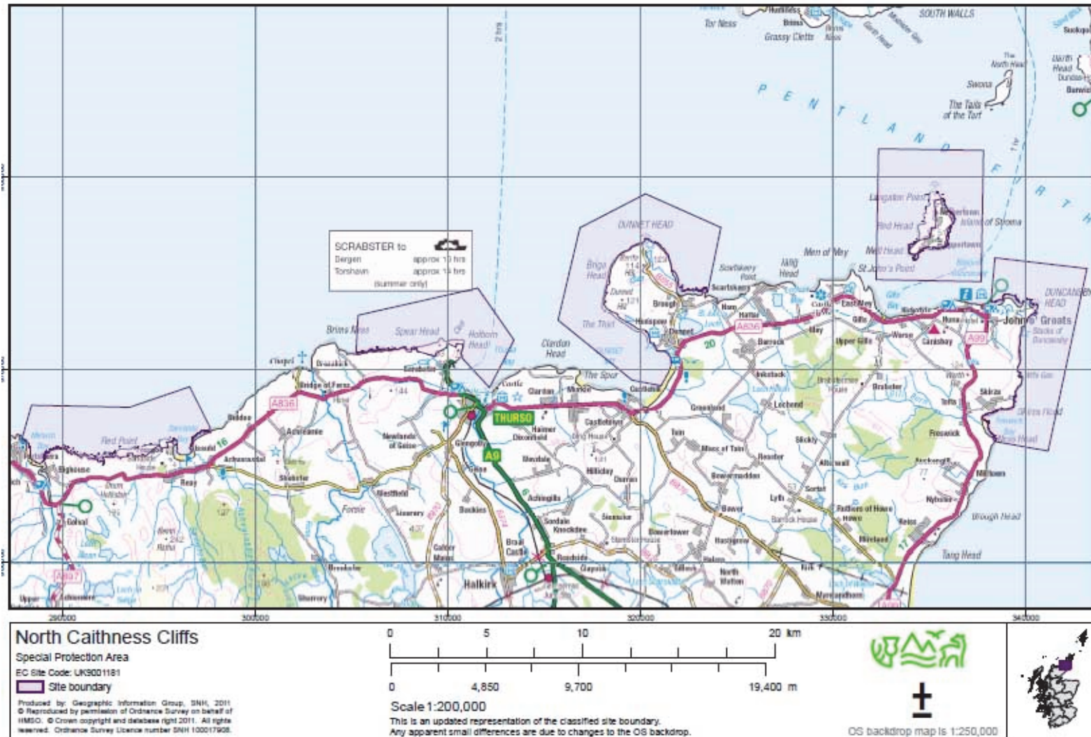
Figure 1. North Caithness Cliffs SPA location.