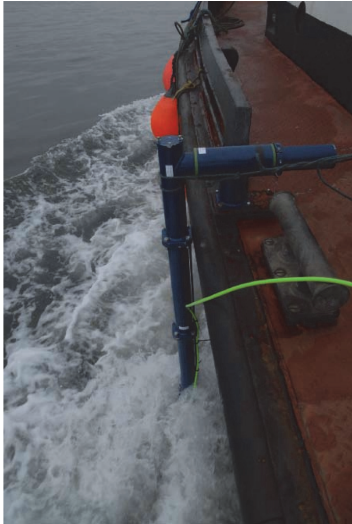
Figure 1. Boat-mounted sonar equipment in the Firth of Forth.