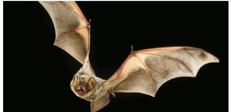
Figure 1. Hoary bats, pictured above, are one of the species associated with wind turbine-related deaths.

Barotrauma: Barotrauma describes injuries that occur when a bat (or other animal) encounters sudden and extreme changes in atmospheric pressure. The rapid pressure fluctuations can rupture air-containing structures in the bodies of mammals which causes internal bleeding and, potentially, death. In 2004, Durr et al. [6] hypothesized that the low-pressure regions that form over the convex surfaces of rotating turbine blades and within vortices that are shed from the blade tips (shown in Figure 2) might cause pressure fluctuations of sufficient magnitude to injure bats that fly too close to operating turbines.