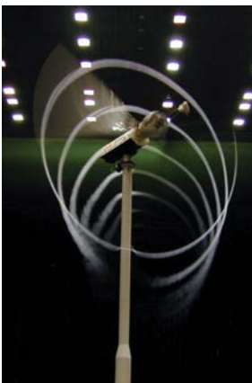
Figure 2. The vortex wake of an operating wind turbine shed from the tips of the rotating blades shown using smoke flow visualization. The location of smoke indicates a region of low pressure with respect to atmospheric pressure.

Trauma from Collision: The most obvious cause of bat deaths around wind turbines is collision with the turbine tower, nacelle, and blades, and indeed many dead bats found around turbines exhibit injuries consistent with impact trauma [4]–[7]. Some experts have hypothesized that bats have difficulty detecting the fast-moving blades [8], which possibly explains the unexpectedly high fatality rate around operating turbines. A recent study supports this conclusion, by documenting bat collisions with moving turbine blades [9].