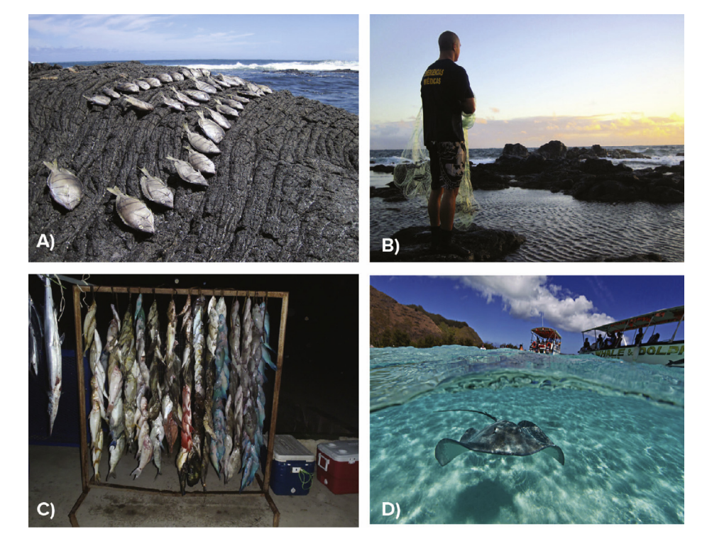
Fig. 2. A) Convict tangs ( Acanthurus triostegus ; Hawaiian name: manini) drying on lava rock on Hawaii Island, Hawaii ; B) Hawaiian fisherman with net ; C) Variety of reef fish species caught in Moorea ; D) Tourism in the no-take reserve in Moorea.

In order to manage recreational and fishing uses of the Moorea lagoon resources, a management plan, called PGEM ("Plan de Gestion de l'Espace Maritime"), was established in 2004, after 10 years of consultation with all users of the lagoon. The PGEM regulates the entire Moorea lagoon and the Moorea outer slope (down to 70 m depth). The management plan is a marine spatial planning tool that