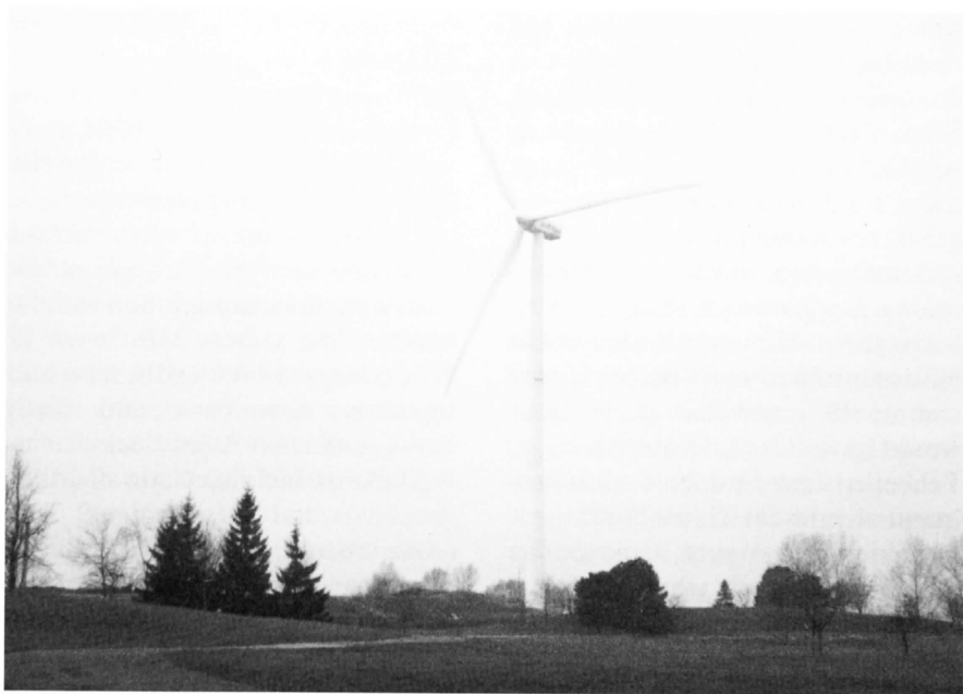
Figure 2: The Pickering wind turbine from the waterfront trail in Alex Robertson Park, looking southwest.

something in that direction. Searches lasted about an hour each time. I walked a pattern that covered all searched area at intervals of about 5 m or less. I varied the approach and specific path somewhat in order to see things from a different perspective, or to be closer to somewhat different parts of the area. But, I was to a large extent guided by the layout of the area.