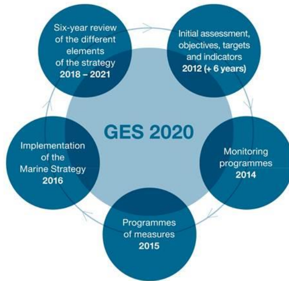
Figure 4.1- Implementation cycles of MSFD.

The MSFD established eleven qualitative descriptors of GES which must be further determined and assessed. Descriptor 11 concerns the introduction of energy, including underwater noise, and requires that it must be at levels that do not adversely affect the marine environment. A technical subgroup under the Working Group on GES was established in 2010 to provide advice on how Descriptor 11 should be determined and assessed (TSG Noise)