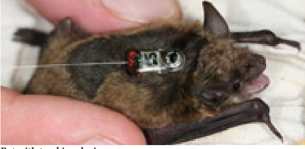
Bat with tracking device

Maine Coastal Island National Wildlife Refuge (NWR), managed by U.S. Fish and Wildlife Service (USFWS), is using satellite tags (devices that track the movement of individual birds) on shearwaters to begin identifying foraging areas and