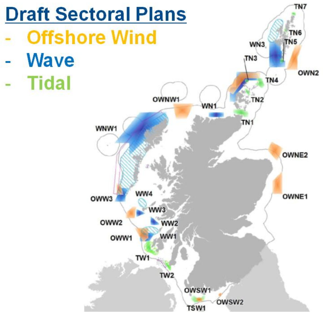
Figure 2 Draft Sectoral Marine Plan Options – Consultation 2013

Energy resource characterisation: The progressive improvements in observational data on wave characteristics and tidal current velocities is indicating that the quality of the energy resources can vary significantly over rather short distances. Waves interact with the coast and seabed topography in complex ways, and spatial and temporal variability of currents and associated turbulence also show repeatable structure over scales that are much smaller than are currently available in nation-scale data layers. Improvements in modelling, validated through field measurements, will improve the quality of marine planning, developer site selection, and engineering design.