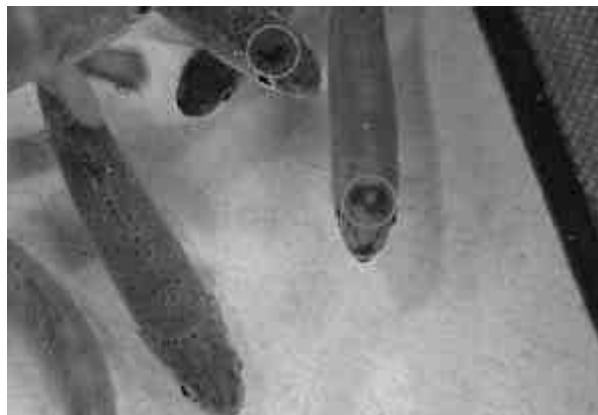
Some rainbow trout developed a black spot on the top of their heads during the 48-hour observation period following simulated passage through a Kaplan turbine. This injury was more frequent in depth-acclimated than surface-acclimated fish.

Nadirs of 68 kPa and 95 kPa: Only one spike-related death occurred in depth-acclimated fish from exposure to 68 kPa. No other deaths occurred for depth- or surface-acclimated fish exposed to 68 or 95 kPa. Injuries (internal hemorrhaging of blood vessels near the