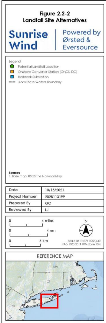
Figure P - 2 Alternative Landfall Sites (COP Figure 2.2-2; Sunrise Wind 2022)