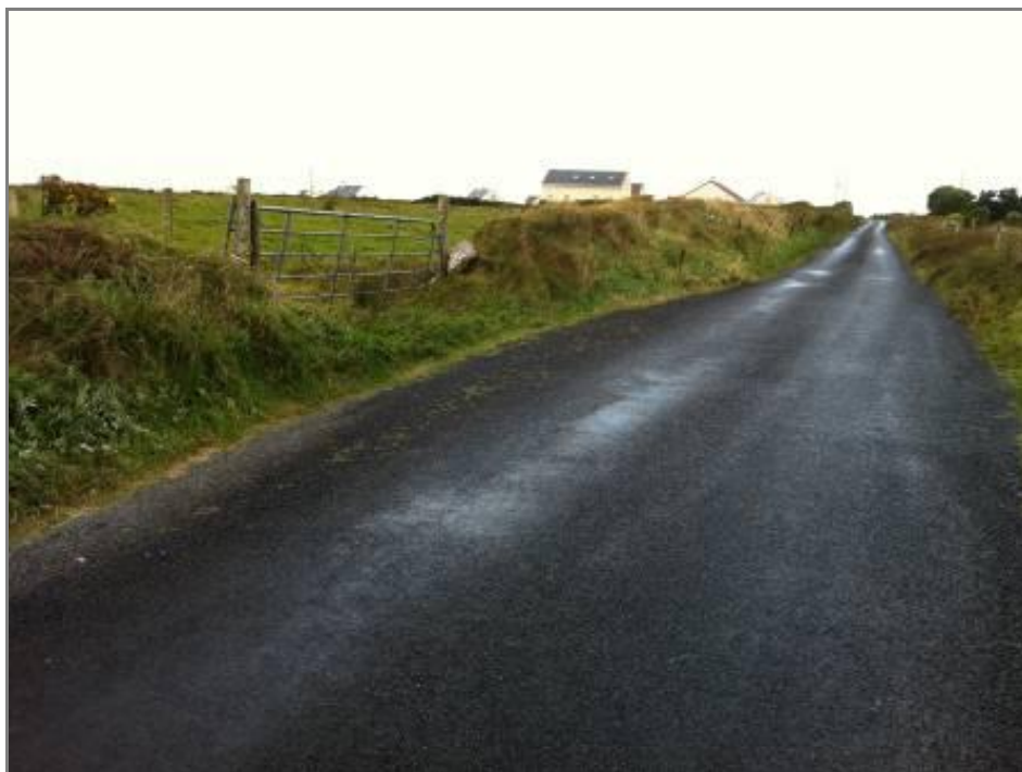
Figure 11-2: L5233, near to the site with a passing bay