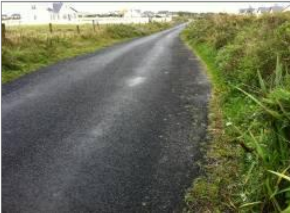
Figure 11-10a: L5233 with passing bays