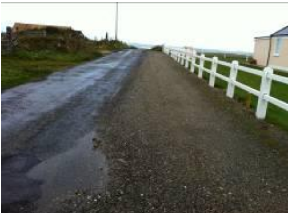
Figure 11-10b: L5233 with passing bays