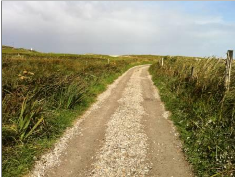
Figure 11-5: Local road connecting site to L5233