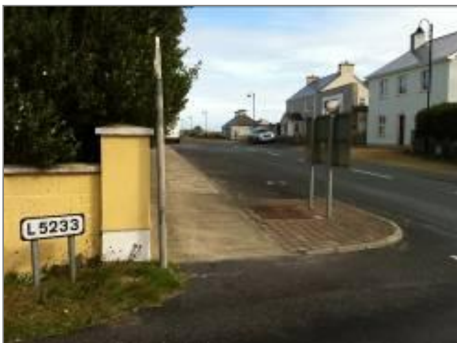
Figure 11-8: R313 / L5233 junction visibility splays