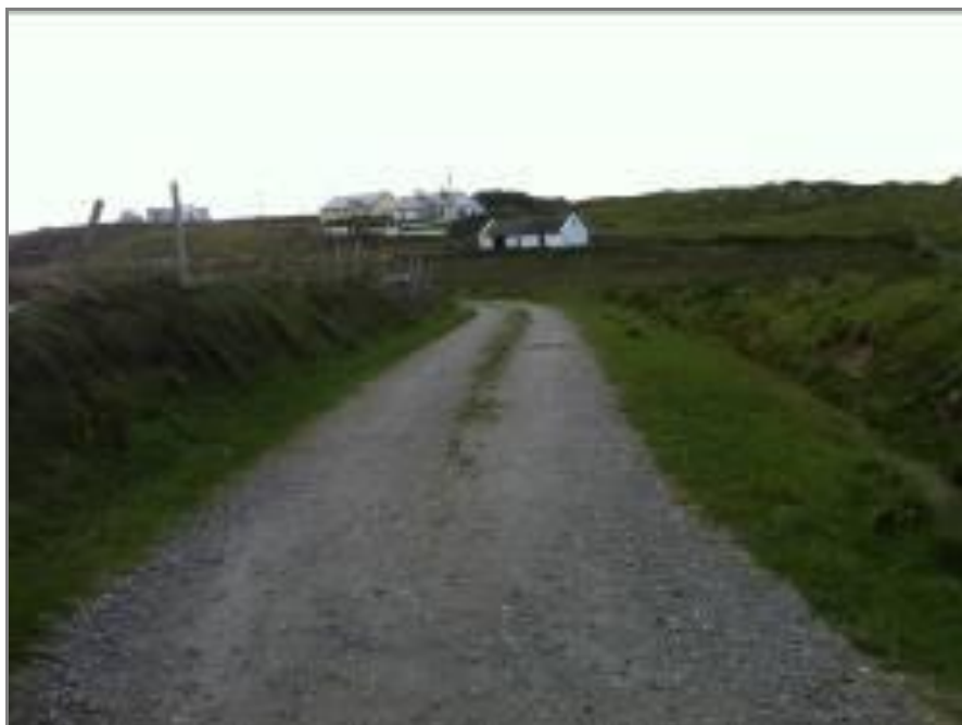
Figure 11-11a: local road to site