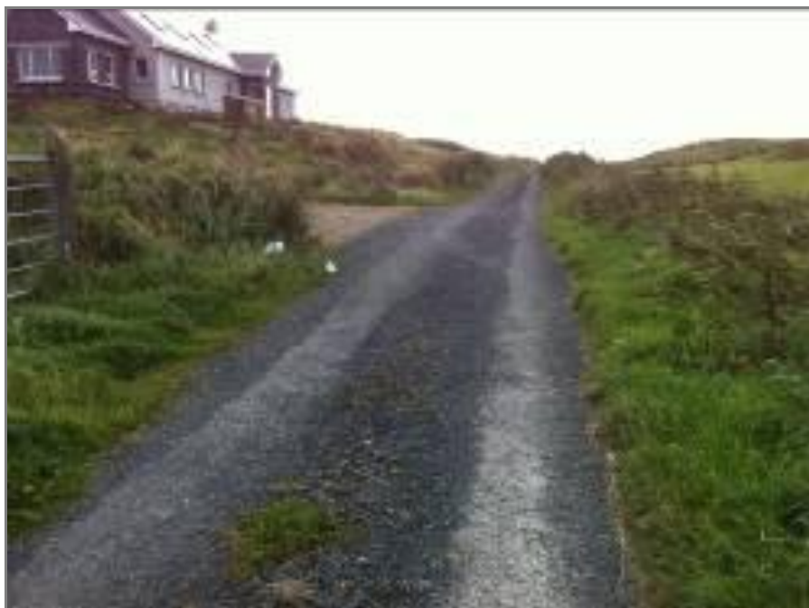
Figure 11-11b: local road to site