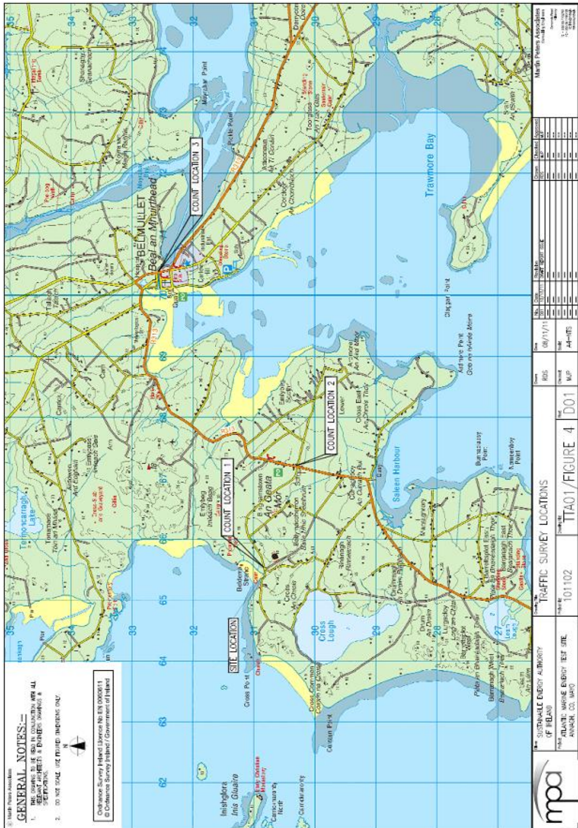
Figure 11-1: Traffic count location