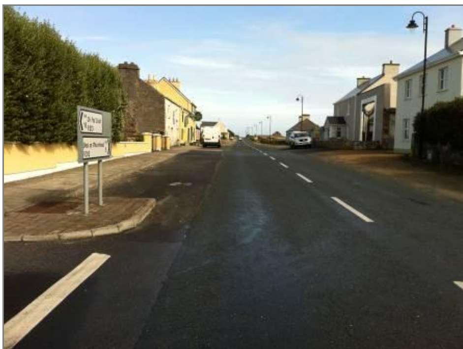
Figure 11-3: R313 Binghamstown