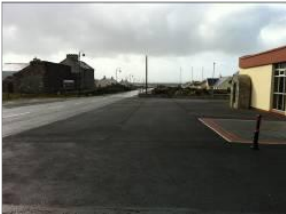
Figure 11-9: R313 / L5233 junction visibility splays