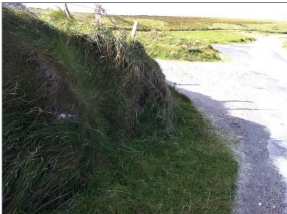
Figure 11-7: L5233 – local road junction