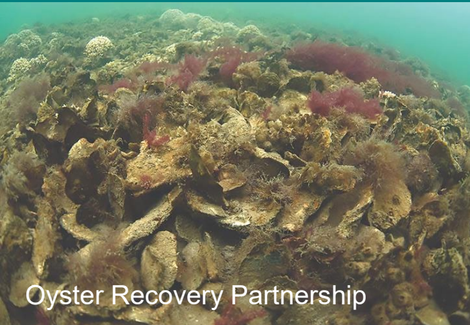
Oyster Recovery Partnership