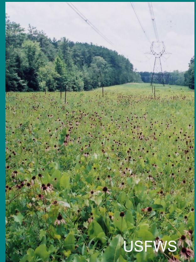
Smooth Coneflower in a ROW