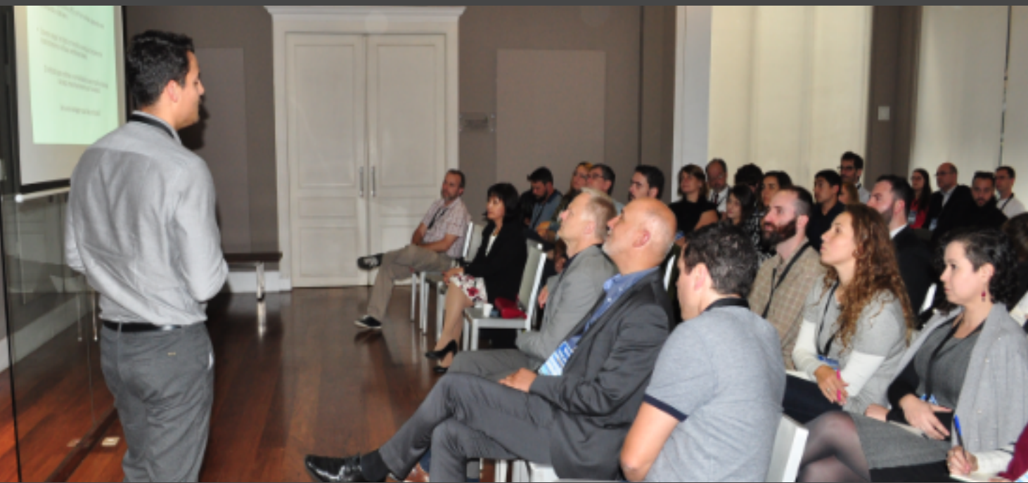
WIBIS in São Paulo, Brazil

Support WIBIS Mexico is an opportunity to contribute to the harmonization of the environmental and social sustainability development, in the wind energy sector.